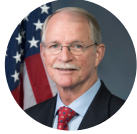
Hon. John Rutherford 5th District, FL