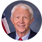
Hon. Jack Bergman 1st District, MI