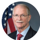
Hon. John Rutherford 5th District, FL