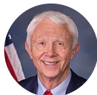
Hon. Jack Bergman 1st District, MI