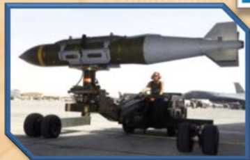
Navy and Air Force Penetrator Bombs