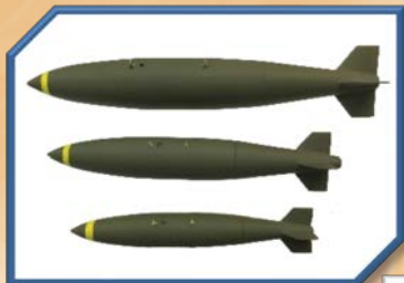
Navy and Air Force General Purpose Bombs