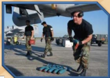
Navy and Air Force Practice Bombs