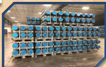
Air Force Cast Ductile Iron Bombs