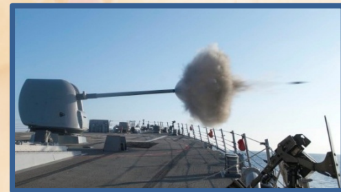
Deck Gun firing 5"/54 Cal Ammo