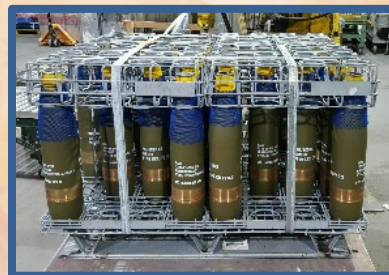
Navy Gun Ammo