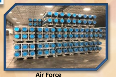
Cast Ductile Iron Bombs