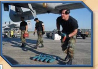
Navy and Air Force Practice Bombs