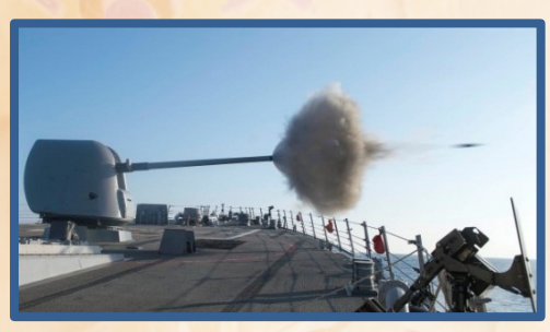
Deck Gun firing 5"/54 Cal Ammo