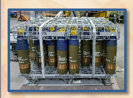
Navy Gun Ammo