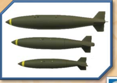
Navy and Air Force General Purpose Bombs