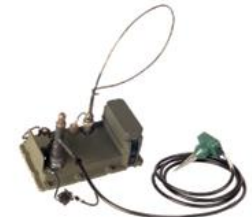
ENCODER-TRANSMITTER UNIT - II (ETU-II)