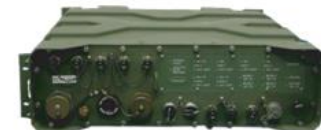
SIGNATURE DATA RECORDER - II (SDR-II)