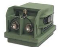
RT-1847 RADIO REPEATER