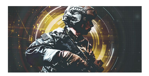
2024 Future Force Capabilities Conference & Exhibition

September 24 – 27, 2024** (Distro D) | Virginia Beach, VA