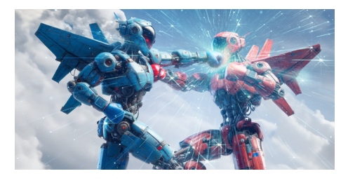
2024 Aircraft Survivability Symposium

August 14 - 16, 2024 | Colorado Springs, CO