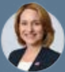
The Hon. Kathleen Hicks Deputy Secretary of Defense

You won't want to miss these key speakers: