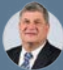
The Hon. Dr. William LaPlante Undersecretary of Defense for Acquisition and Sustainment