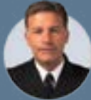
Admiral John Aquilino US Indo Pacific Command