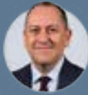
The Hon. Gabo Canaville Undersecretary of the Army