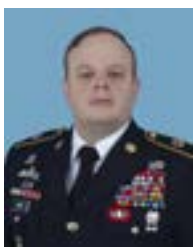
SGM NICHOLAS CERRA, USA (RET)