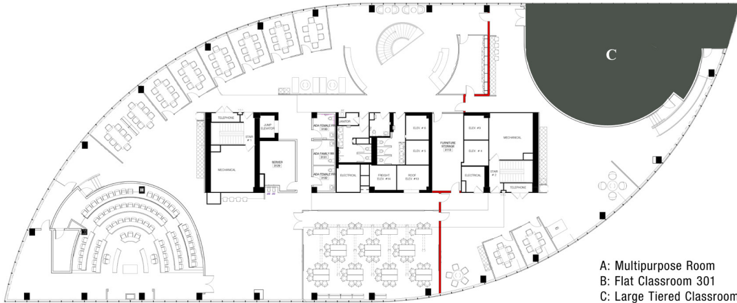
A: Multipurpose Room B: Flat Classroom 301 C: Large Tiered Classroom