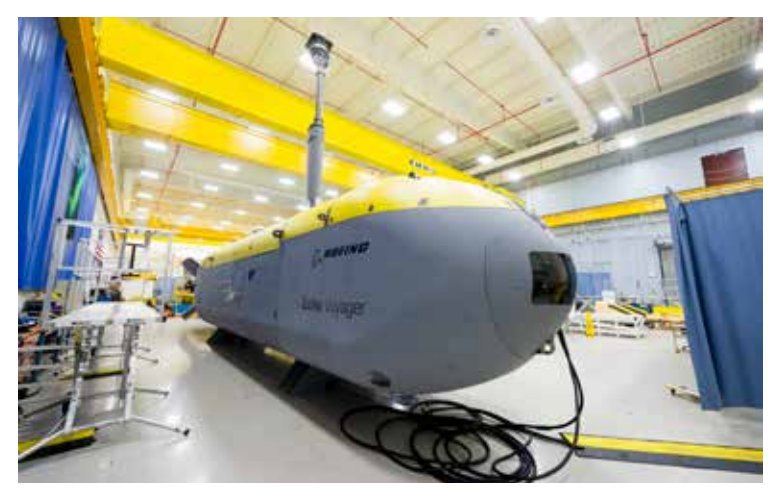
Boeing EchoVoyager UUV

However, there is always room for improvement and new technologies and approaches. New transducer materials and sensor designs, new forms of signal processing, efficient use of the data products created by the sensor and data processing consistent with the autonomy controller requirements are all anticipated to be focus areas to make unmanned platforms have the necessary capabilities to perform the anticipated missions of these platforms.