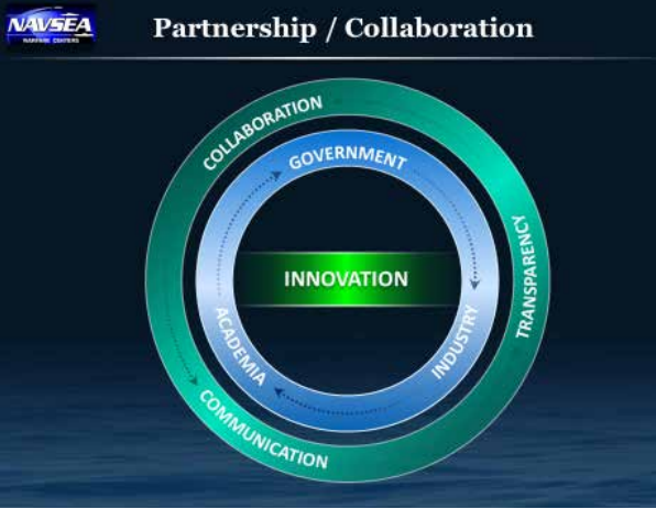
Figure 2- Communicate / Collaborate / Innovate / Demonstrate

Thank you NUWC for hosting this event. Accommodating the increase in OPTEMPO required to plan and support