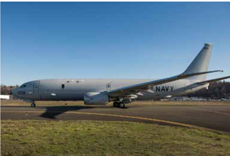
Navy partnership hits milestone, 50th P-8A delivered

on budget and on schedule. The Aviation Committee is honored to help facilitate the needed information exchange and be a part of such extraordinary developments. These platforms will continue to evolve and integrate with unmanned systems and sensors as needed to keep pace with the tremendous advancements these emerging technologies are making every day. Below are some announcements and achievements released in the public domain that the Aviation UWD and supporting communities can be proud of: