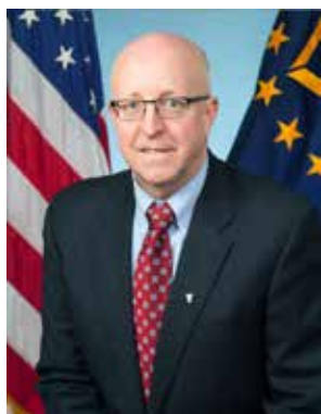
DONALD F. MCCORMACK EXECUTIVE DIRECTOR, NAVAL SURFACE WARFARE CENTER (NSWC) AND NAVAL UNDERSEA WARFARE CENTER (NUWC)