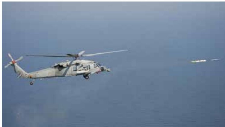
MH-60R/S life-extension, upgrades await funding

The US Navy (USN) is working through a variety of upgrades for its workhorse Sikorsky MH-60R/S helicopters, and is awaiting studies for an upcoming life-extension programme.