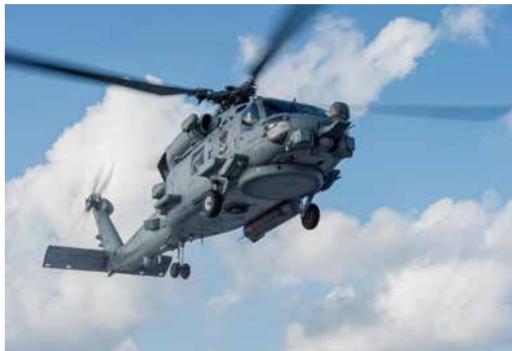
US Navy's MH-60R submarine periscope detection kits

The navy is also planning a 'phase 2/3' - although this is not yet funded - to add Multispectral Targeting (MTS) slewing based on where heads are pointed, a CCIP reticle for APKWS and Hellfire missiles, and degraded visual environment (DVE) capability.