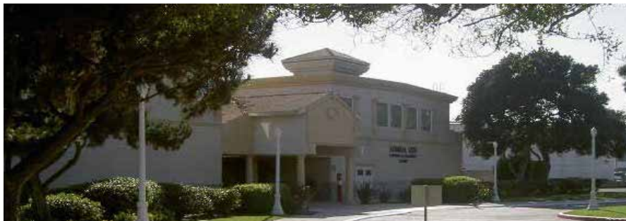
ADMIRAL KIDD CONFERENCE CENTER NAVAL BASE PT. LOMA

More importantly, I ask that each one of you as individuals and as members of your respective companies continue your quest for excellence in the execution of your lives. America needs you; and as a team we can achieve more and continue to sustain our dominance of the undersea domain.