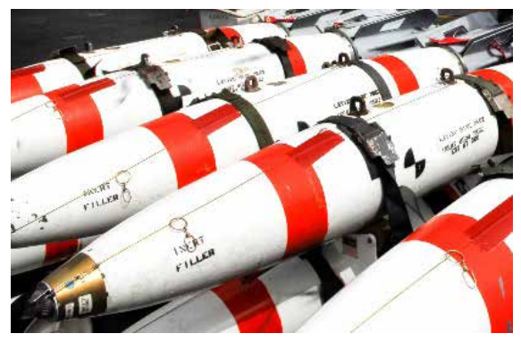
Mk 62 Quickstrike Exercise Mines

their tactical plans, and making them think about MCM and the consequences. Making the adversary spend significant resources and time conducting MCM, as has been done to the U.S. Navy, is long overdue.