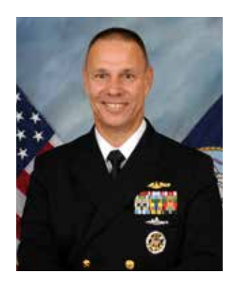
RDML MOISES DELTORO, III USN, COMMANDER, NUWC