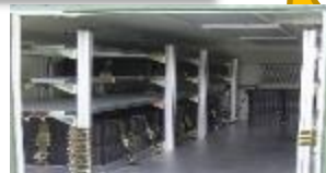
Automatic Test Equipment (ATE) Shelter