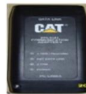
CATCOM 3 H70102G