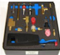
Transducer Kit H70212H