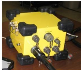
Test Adapter Vehicle (TAV)