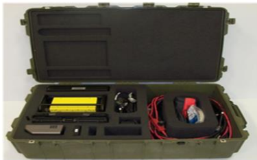
Vehicle Automated Diagnostic System (VADS)

VADS is a lightweight, portable diagnostic system of modular design that is used to perform intrusive diagnostics on diesel engines, transmissions, central tire inflation, anti-lock braking, and other vehicle data bus systems.