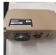
WATS ATE A78102H