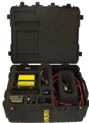
B70002B Analyzer Set, Vehicular

VADS is a lightweight, portable diagnostic system of modular design that is used to perform intrusive diagnostics on diesel engines, transmissions, central tire inflation, anti-lock braking, and other vehicle data bus systems. The vehicle communication interface is called the Test Adapter Vehicle (TAV) that is interfaced with an instrument controller with available USB port, DVD drive, Diagnostic Software and Windows based operating system. This is combined with a complete set of interconnect cables and transducers/adapters in one weather resistant transit case.