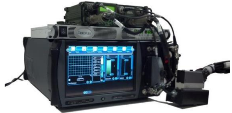
AN/USM-718A (GRMATS 7200)