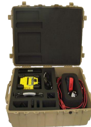
E70002B Analyzer Set, Vehicular