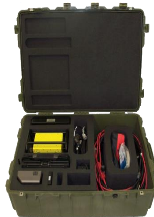
D70002B Analyzer Set, Vehicular