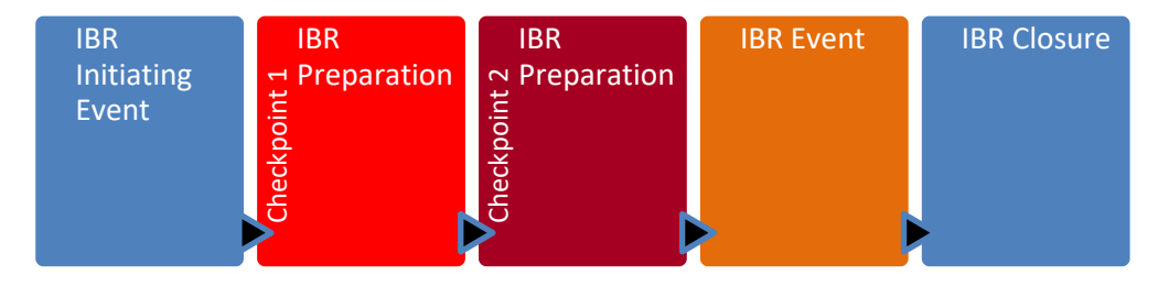
Figure 1. IBR Process Flow

Figure 1 illustrates a continuous IBR process and its five phases, as shown below: