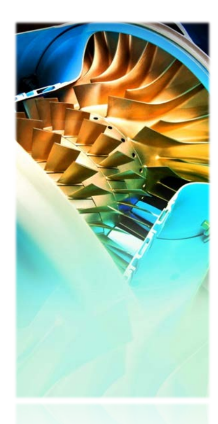
Pratt & Whitney Canada