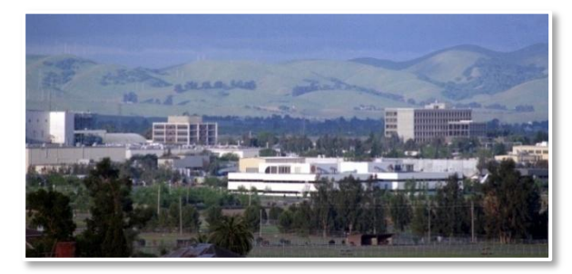
Lawrence Livermore National Laboratory Livermore, California – 2007