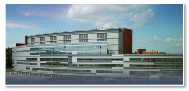
National Biodefense Analysis/Countermeasures Frederick, Maryland– 2006