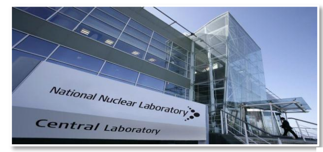
United Kingdom National Nuclear Laboratory Sellafield, United Kingdom – 2009