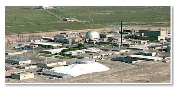
Idaho National Laboratory Idaho Falls, Idaho – 2004