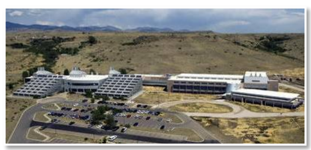
National Renewable Energy Laboratory Golden, Colorado – 1998