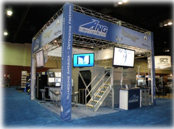
KC-135 BOSS Production