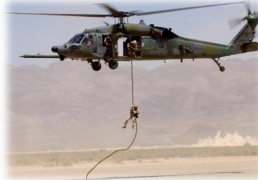
HH-60G PHAROS Prototype