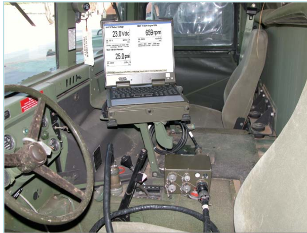
Internal Combustion Engine (ICE) Provides at-platform automatic test diagnostic interface between MSD-V2 and current/future tactical vehicles.