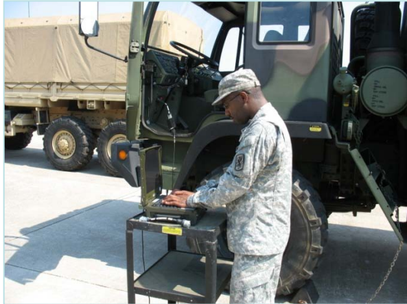
Maintenance Support Device - Version 2 (MSD-V2) is the current at-platform general-purpose automatic test system supporting diagnostic requirements of current/future forces.