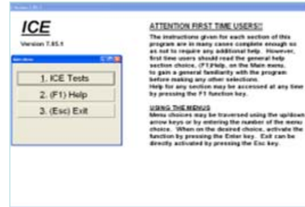
Internal Combustion Engine (ICE) software is Government owned software used at-platform by maintainers to perform weapon system diagnostics and repair.