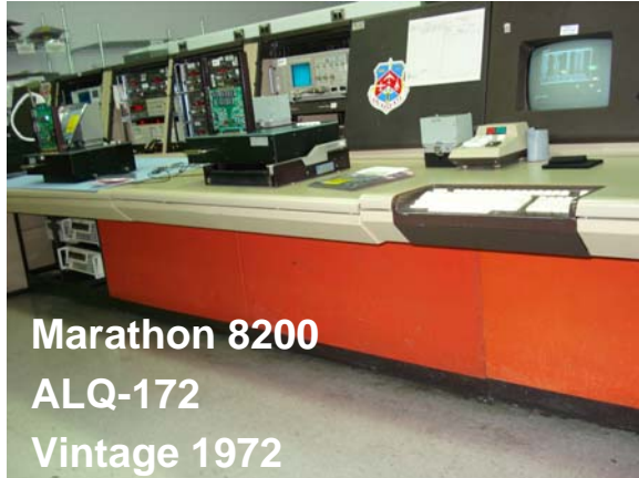
Marathon 8200 ALQ-172 Vintage 1972