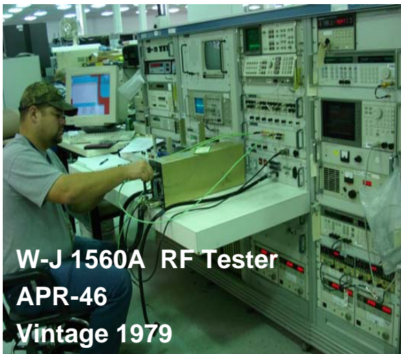
W-J 1560A RF Tester APR-46 Vintage 1979