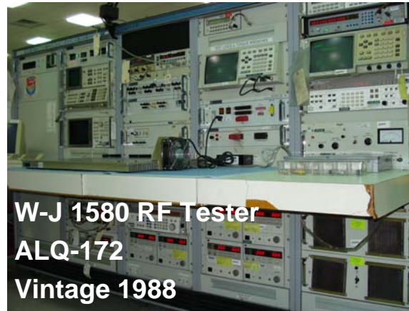
W-J 1580 RF Tester ALQ-172 Vintage 1988