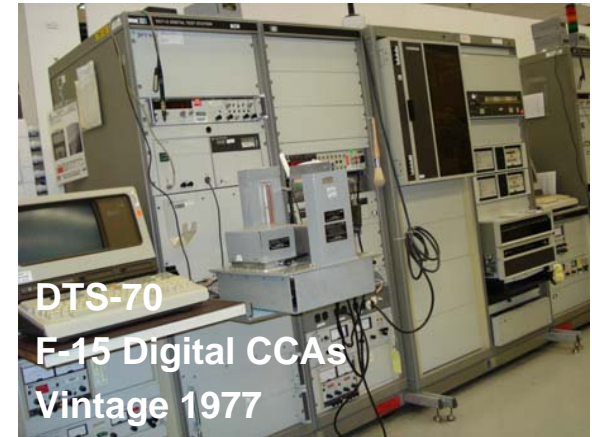
DTS-70 F-15 Digital CCAs Vintage 1977