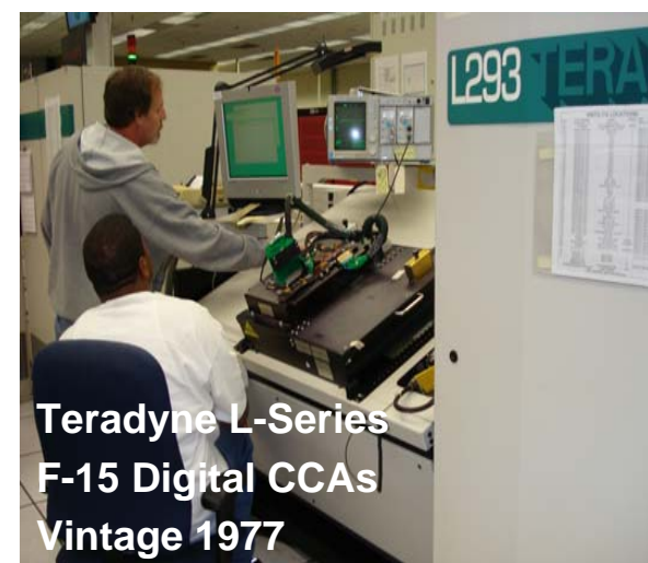
Teradyne L-Series F-15 Digital CCAs Vintage 1977