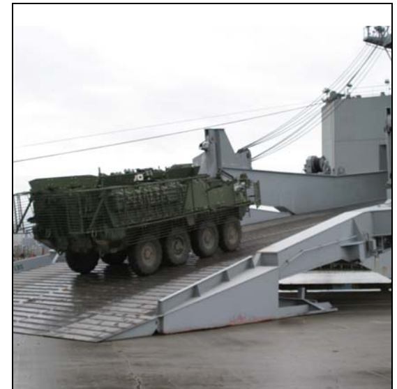
Army vehicle destined to Southwest Asia being loaded onto a vessel at the Port of Beaumont, Texas.

— As always, SDDC will continue providing tailored and agile capability and sustainment solutions that meet the Warfighter's requirements.