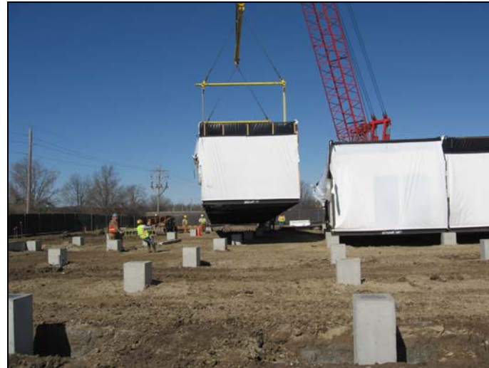
SDDC's Temporary Modular Building being built at Scott Air Force Base, IL.