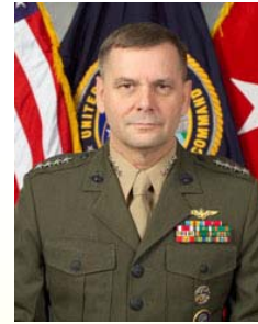
The Vice Chairman Gen James E. Cartwright