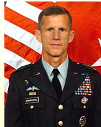
Director of the Joint Staff LTG Stanley McChrystal