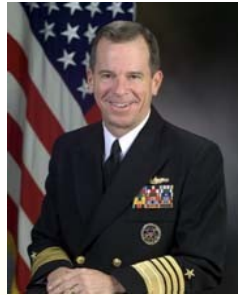
The Chairman ADM Michael G. Mullen