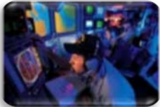
Test & Training Systems