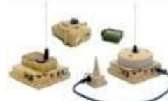
Intelligence, Surveillance, & Reconnaissance