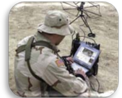
Multi-source Intelligence Framework Solutions