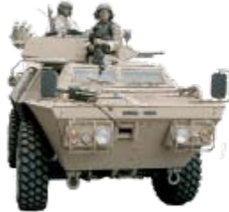
Tactical Wheeled Vehicles