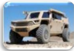
Advanced Mobility Solutions