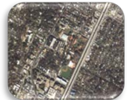
Geospatial Analysis Solutions