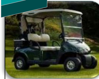
E-Z-GO Greenlee Jacobsen Kautex