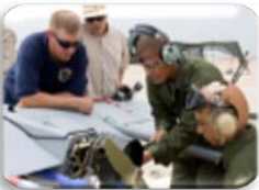
Logistics & Technical Services