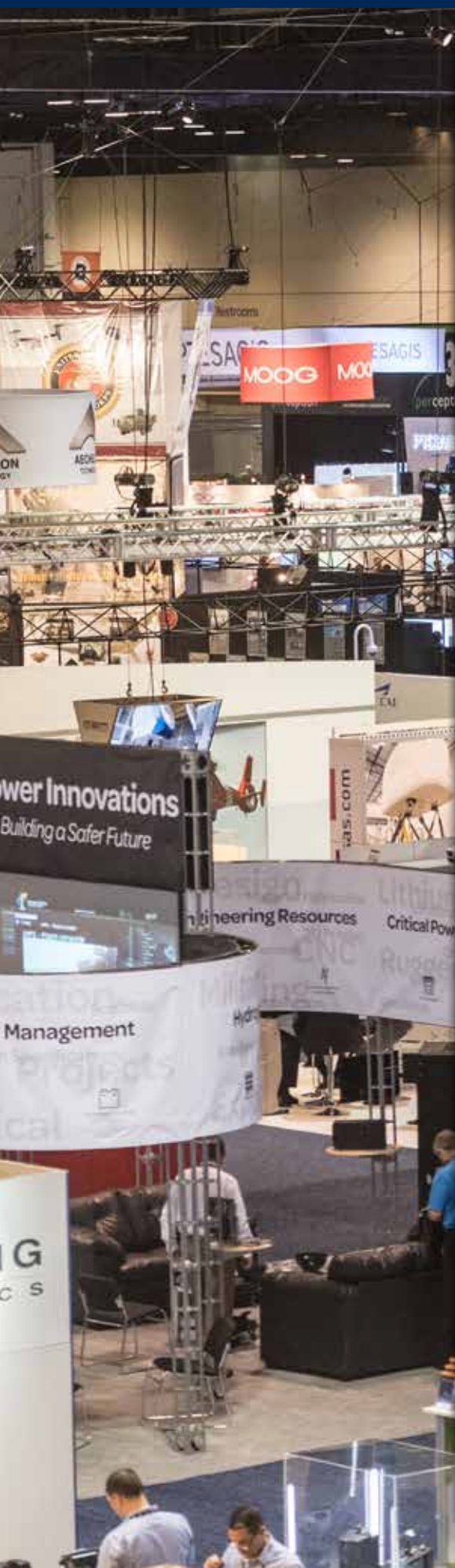
EXHIBIT HALL MARKETING